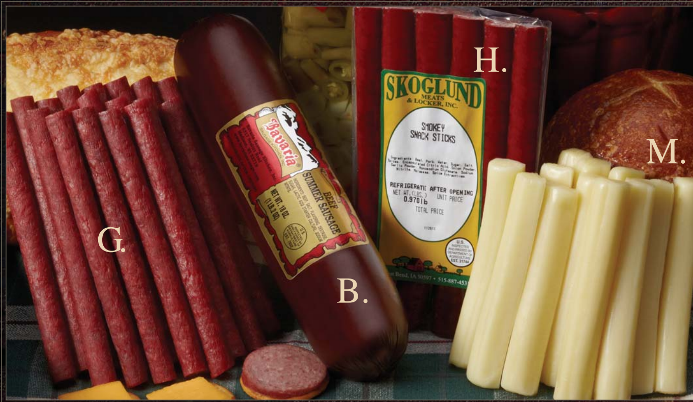
B. 18 oz. Gourmet Beef Sausage M. 24 oz. String Cheese G. 40 oz. Beef Sticks (40-50 sticks) H. 16 oz. Smokey Snack Sticks (11-12 sticks)