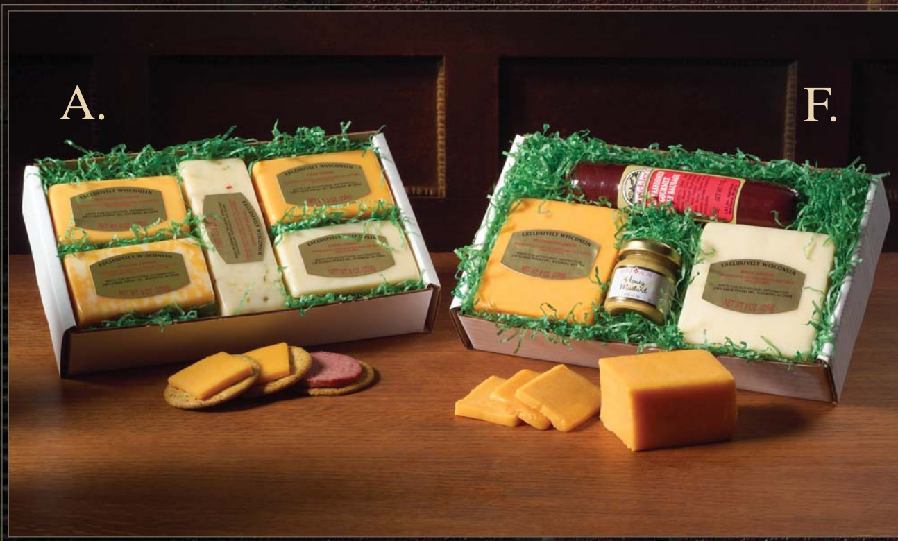
A. Cheese Lover's Delight 5-8oz. Wisconsin Cheese--Cheddar, Brick, Colby, Co-Jack and Pepper Jack F. Picnic in a Box 2-8oz. Cheeses, 1-7oz. Sausage & 1 Mustard

*C, D, E, G and M individually packaged in Gift Box *All weights and counts are approximate.